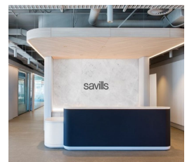
Customer Service 02 9416 9393