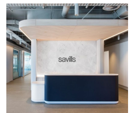
Customer Service 02 9416 9393