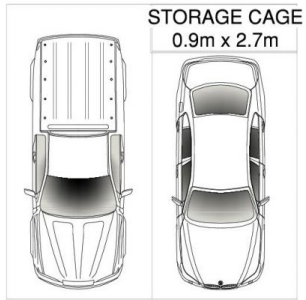
SECURE COVERED CAR SPACE 5.4m x 5.3m (NOT ACTUAL LOCATION)